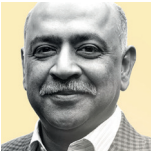
ARVIND KRISHNA SVP, DIRECTOR OF RESEARCH, IBM

Combining behavioural science, financial domain knowledge and machine learning, Sybenetix detects and investigates suspicious trading in a faster and smarter way.