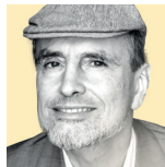
JÜRGEN SCHMIDHUBER SCIENTIFIC DIRECTOR, SWISS AI LAB IDSIA