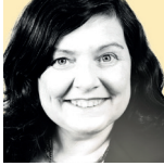
ANNE BODEN CEO AND FOUNDER, STARLING BANK

Former co-founder of Boso.com and GoCardless, Blomfield's app-only bank, Monzo, was valued at £50 million after an autumn 2016 funding round of £4.8 million.